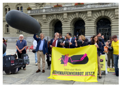
The Initiative to Ban Nuclear Weapons was launched in July in front of the Swiss Parliament in Bern.

This position contradicts Switzerland's humanitarian tradition and the wishes of parliament. It also goes against Switzerland's commitment to the "Women, Peace and Security" agenda, which it explicitly highlighted in its candidacy for the UN Security Council. A centrepiece of this agenda is the equal participation of women in conflict prevention and in efforts to achieve security and sustainable peace. Peace activists around the world cite disarmament and arms control as key objectives of the agenda, as this is the only way to achieve sustainable peace and comprehensive security.