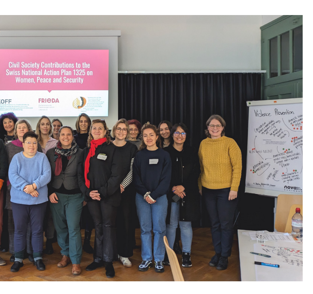
Representatives of over 20 organisations took part in consultations on the 5<sup>th</sup> National Action Plan on "Women, Peace and Security".